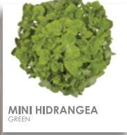
MINI HIDRANGEA GREEN