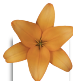
LILY L.A. CAESARS PALACE