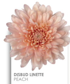
DISBUD LINETTE PEACH