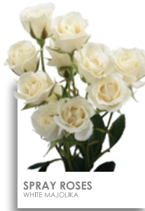
SPRAY ROSES WHITE MAJOLICA